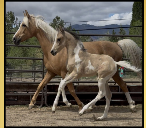
Pictured above is Summer & 6 month Cosmic trotting together

Illusion Golden Tulip (pictured below), 4 years old, Owned by Bissen Etal from Preston, MN is handled by a 4-H youth