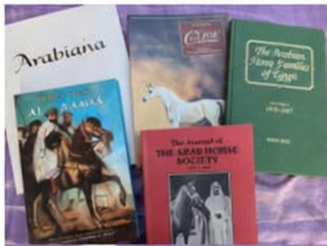
Arabian, Showhorse & Racing Books, Art, Memorabilia: Sold, Bought, Traded, Appraised